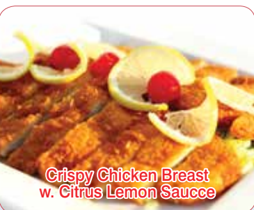
Crispy Chicken Breast w. Citrus Lemon Sauce