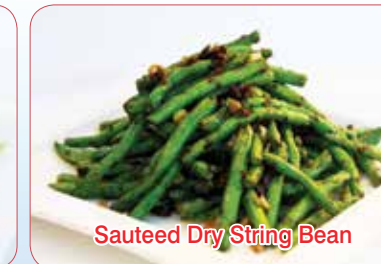
Sauteed Dry String Bean