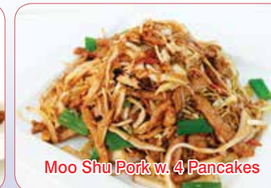
Moo Shu Pork w. 4 Pancakes