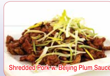
Shredded Pork w. Beijing Plum Sauce