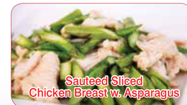
Sauteed Sliced Chicken Breast w. Asparagus